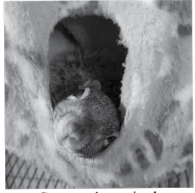
Greyson the squirrel