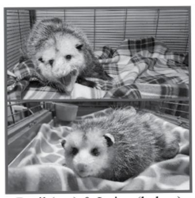
Basil (top) & Irving (below)