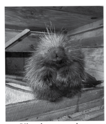
Silas the porcupine